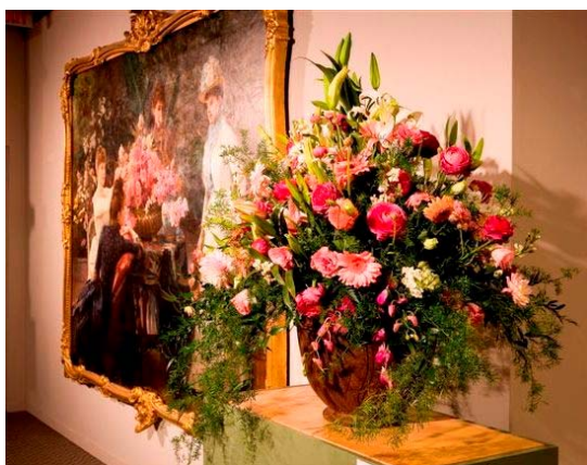
Spring Flowers - In The Conservatory by Julius Stewart, 1890, Oil on canvas. Collection of Phoenix Art Museum. Gift of Citibank.

BEAUTY BEFORE YOUR EYES. Our event opens with a fabulous luncheon. Watch